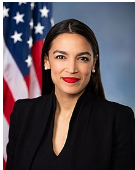
Rep. Alexandria Ocasio Cortez