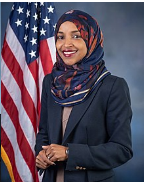
Rep. Ilhan Omar