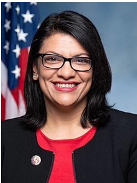
Rep. Rashida Tlaib